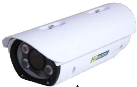
FW9302-PXM 5MP All-in-One Housing

FW9302-PXM is Outdoor IR All-in-one Motorized IP Camera which is equipped with 6.82MP Progressive Scan CMOS image Sensor. As it supports simultaneous H,265, H,264 and MJPEG Video Compression, less network bandwidth and storage space required. It also delivers high quality video image at 15fps@5M(2592x1944) or 30fps@4M(2688x1520) in progressive mode.