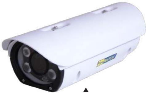
FW9302-TXM 3MP All-in-One Housing

FW9302-TXM is Outdoor IR All-in-one Motorized IP Camera which is equipped with 3.21MP Progressive Scan CMOS image Sensor. As it supports simultaneous H,265, H,264 and MJPEG Video Compression, less network bandwidth and storage space required. It also delivers high quality video image at 30fps@3M(2048x1536) in progressive mode.