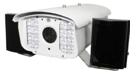
▲ FW9305-GSM 2MP Global Shutter ANPR/LPR

FW9305-GSM is Outdoor IR All-in-one Motorized Camera which is equipped with 3.19MP Global Shutter CMOS image Sensor. with the highest sensitivity sensor, it is especially superior in low light condition. As it supports simultaneous H.265, H.264 and MJPEG Video Compression, less network bandwidth and storage space required. It also delivers high quality video image at 30 fps @ 2MP (1920X1080) in progressive mode.